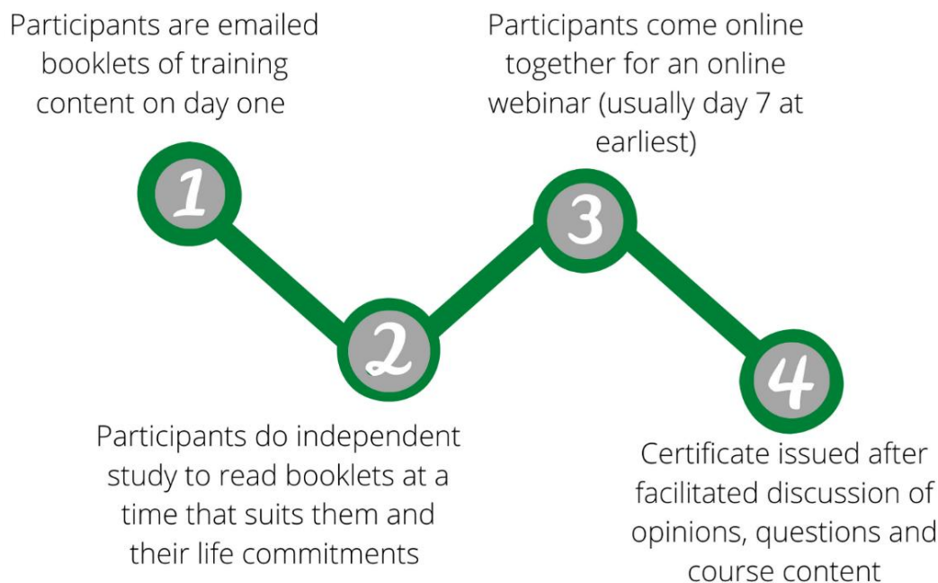
Figure 2: The participant journey