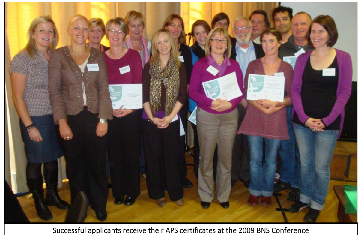
Successful applicants receive their APS certificates at the 2009 BNS Conference

"By doing the APS the project is now stronger, more streamlined and in a better position to deliver a service that meets the needs of clients, funders and the project values."